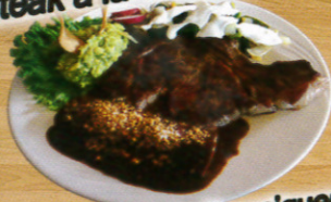
Steak a la Tampiquena